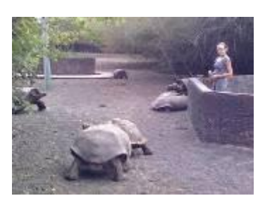
WEDNESDAY: Isabela Island (Wall of Tears and Interpretation Center)

We will visit a historical place that was built by prisoners from Ecuador's first jail. There we will learn something about their life and habits in jail. Later, we will pay a visit to the fascinating Interpretation Center Arnaldo Tupiza, where we will discover Galapagos' mysteries and we visit the breading center.