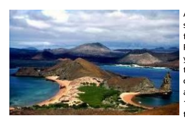
TUESDAY: Bartolome - Santiago: Sullivan Bay

At Bartolomé Island you will ascend to admire the spectacular panorama of the Sullivan Bay and the famous Pinnacle Rock. The beaches at the foot of the Pinnacle Rock are excellent for snorkeling from which you can discover the marvelous underwater world. In the afternoon, you will visit Sullivan Bay on the east coast of Santiago. We land on a white coral sand beach and begin our walk over lava that flowed less than 100 years ago. This is the perfect place to see and feel the volcanic origin of Galapagos. (B, L, D)